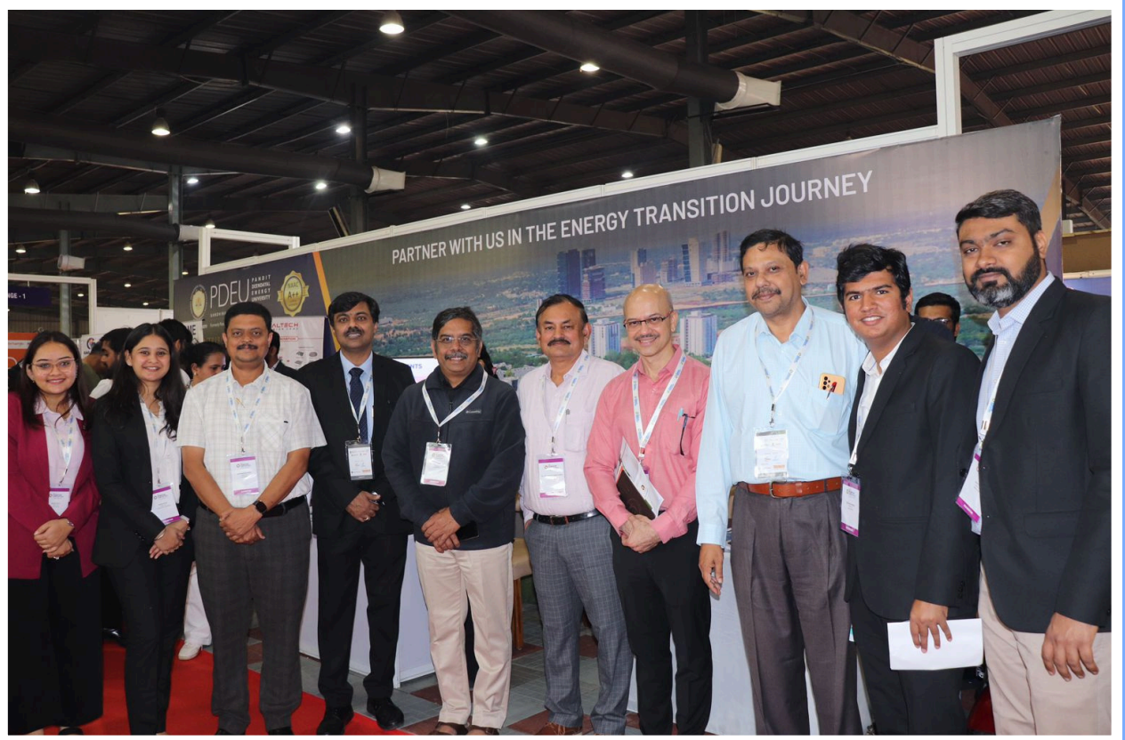
TEAM PDEU IIC